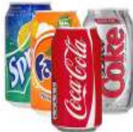
375ml cans $2.20 each