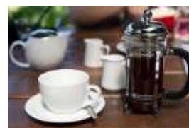
Plunger coffee and tea with milk $3.00 per person *cup & saucer not included