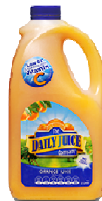
2 Litre Juice $7.50 each