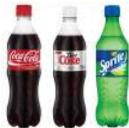
390ml bottles $3.80 each