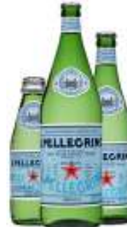
San Pellegrino 1 litre Bottles $5.50 each