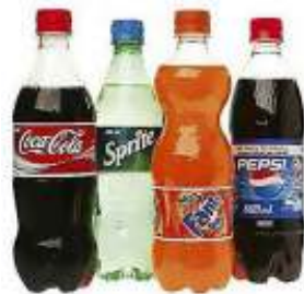
1.25 litre drinks $4.50 each