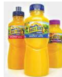
500ml bottles $3.80 each